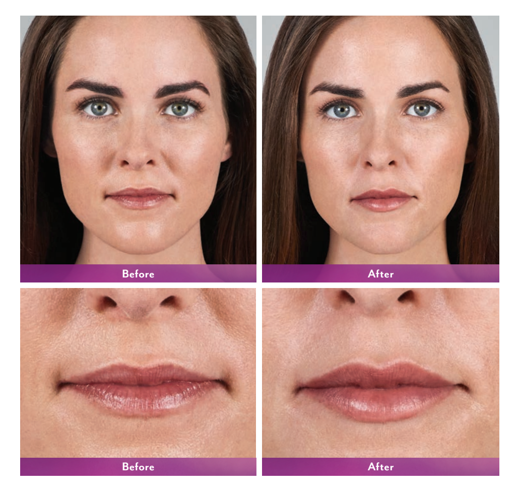
Actual patient. Results may vary. Unretouched photos of paid patient taken before treatment and 1 month after treatment. A total of 1.1 mL of JUVÉDERM VOLBELLA® XC was injected—0.05 mL into the corner lines and 1.05 mL into the lips for lip augmentation.